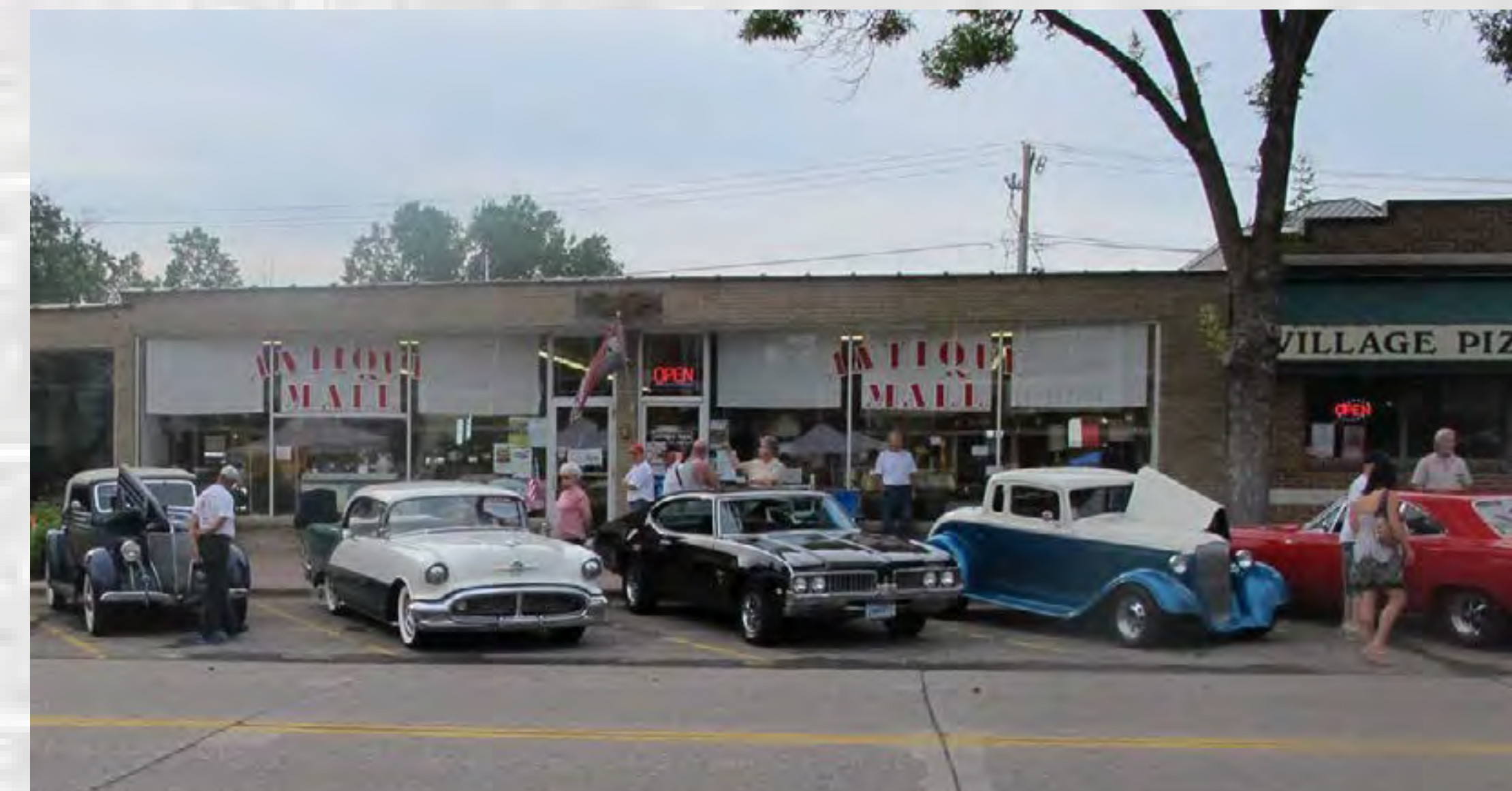
The annual car show in front of the Antique Mall (Top), below, the Gateway Bike Trail (Left) & a restaurant downtown. (Right)