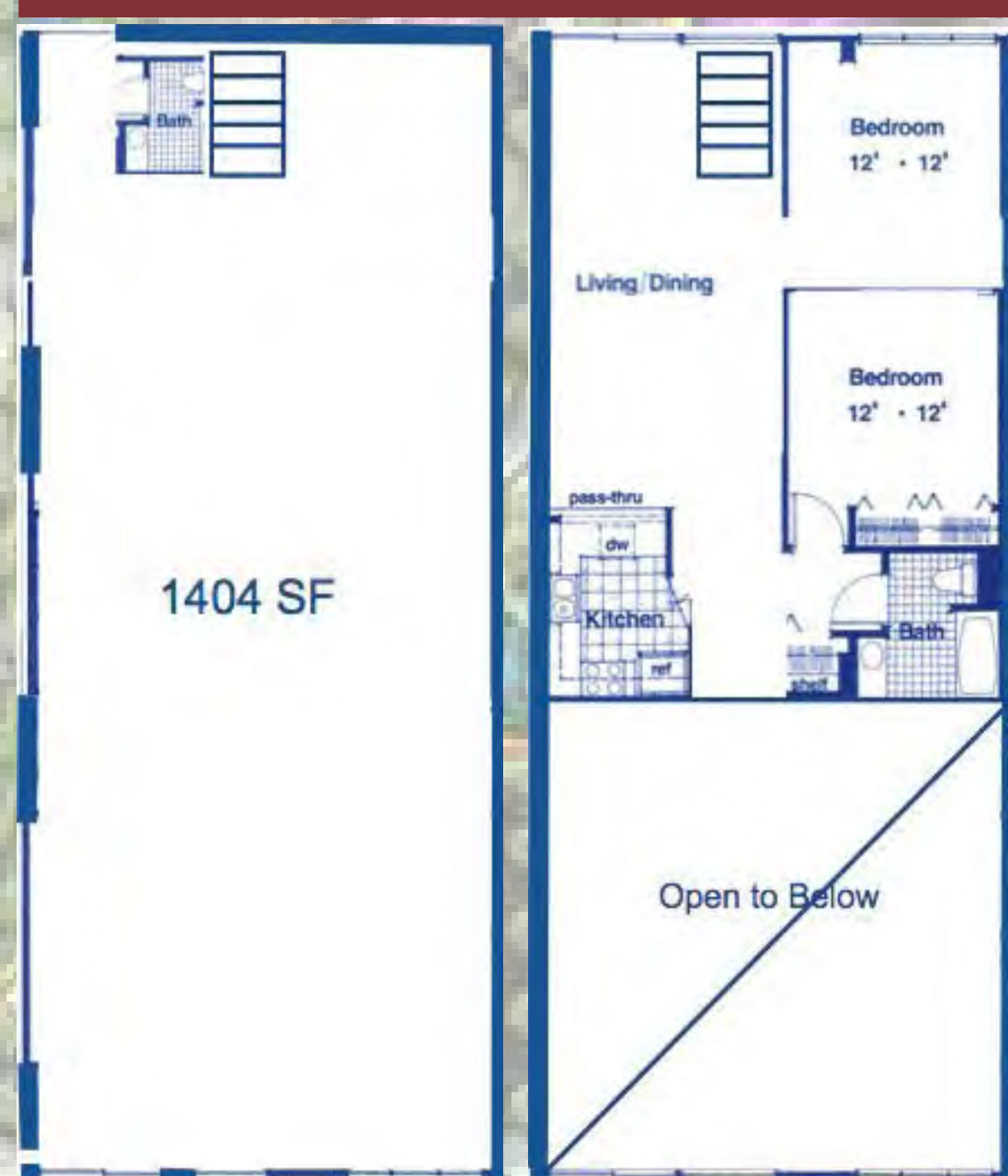
Each storefront will begin as empty (Left) and will be topped by a one bedroom unit for store owners.