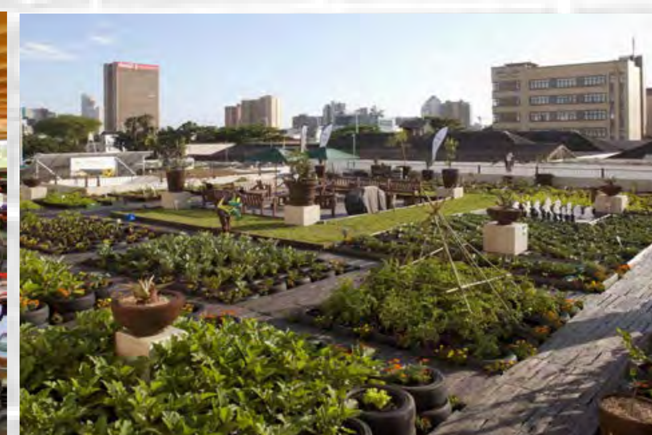
Secured bike storage (Left) and one of the three co-op rooftop gardens for residents to use (Right)