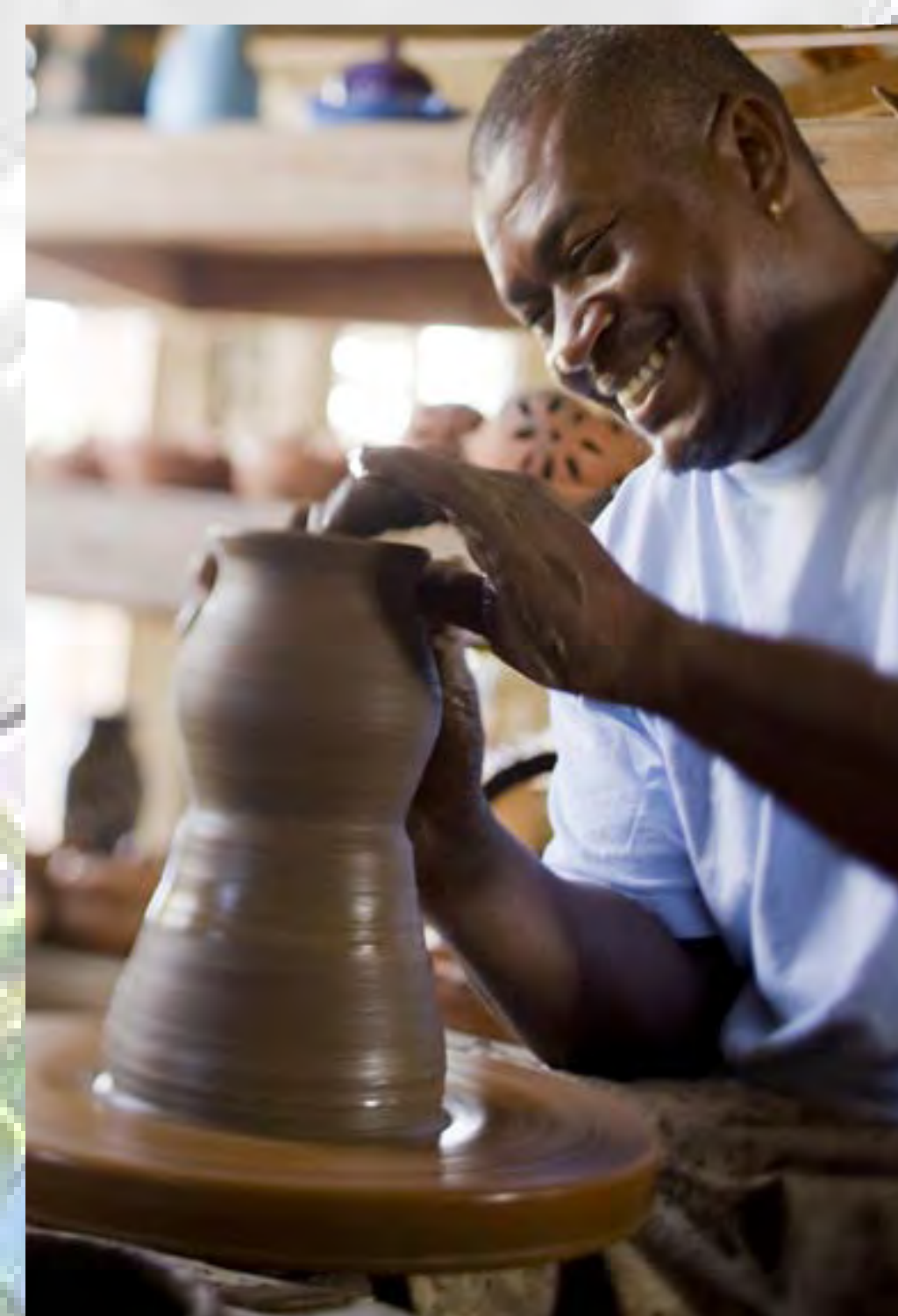
Brick and stucco facade to compliment local architecture (Left), Second Floor Loft style interiors to maximize space (Top Middle), a hat maker and pottery artist at work (Below Middle and Right)