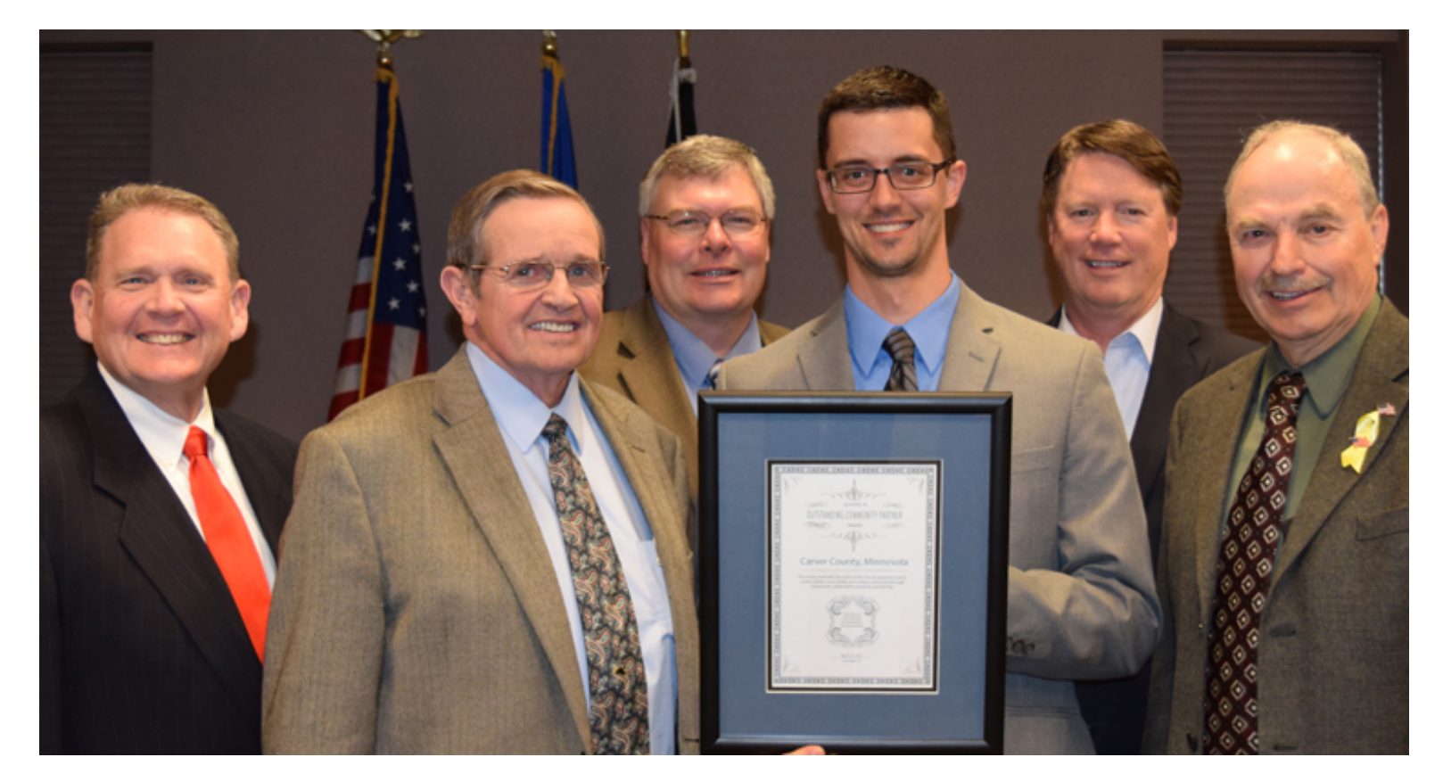
Accepting the EPIC Network's Outstanding Community Partner Award for the Resilient Communities Projects are, from left

A poster session of student work on all of the projects will be presented from 2-4 p.m. on Friday, May 13, at the University of Minnesota McNamara Alumni Center, 200 Oat St SE, Minneapolis. Information on the RCP is also available from the County's website, <a href="www.co.carver.mn.us">www.co.carver.mn.us</a> (<a href="http://www.co.carver.mn.us/">http://www.co.carver.mn.us/</a>), and the University of Minnesota RCP site, <a href="http://rcp.umn.edu/">http://rcp.umn.edu/</a>).